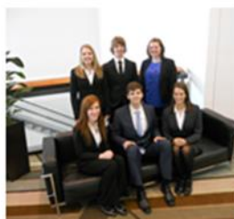
Enactus at the Regional Competition

The Goshen College Enactus Group was established in late November of this school year and began meeting in January 2013. Our chapter's mission statement is: "To capitalize on our strengths and knowledge in order to meet the needs of our neighbors in our local communities and around the world."